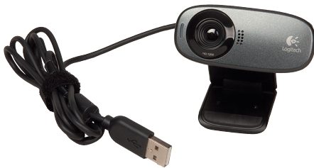
USB Digital Webcam

Set up your card printing system and begin producing photo IDs in minutes with the Zebra® QuikCard ID Solution™ — no software expertise necessary. It includes everything you need to quickly and cost-effectively make professional-quality identification, security and commerce-related cards.